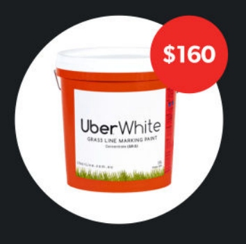
UberWhite 10:1 Ratio Grass Line Marking Paint – 15L

Take a look at some of Uberline's best value products or visit their website to view their full range.