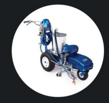
Graco LineLazer ES 1000 Electric Battery-Powered Airless Line Striper, 1 Manual Gun, 1 Lithium Battery

The LineLazer ES 500 is a fully-capable line striper for those small to medium-sized re-stripe jobs—while introducing the benefits of battery-powered technology.