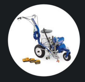
Graco LineLazer ES 500 Battery-Powered Airless Line Striper 25U548

Experienced field maintenance professionals know the difference. Graco FieldLazer professional airless field marking systems are recognized as solid investments that perform reliably, year after year.