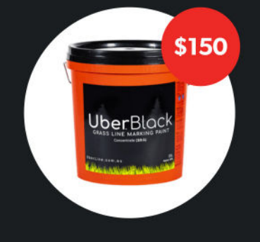
UberBlack 10:1 Ratio Grass Line Marking Paint – 15L

UberWhite is the best value per litre of diluted paint. 10:1 Concentrate. Makes up to 165L of Uber White grass line marking paint.