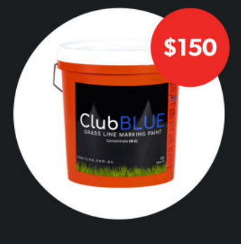
ClubBlue 4:1 Ratio Grass Line Marking Paint – 15L

UberBlack is the best value per litre of diluted paint. 10:1 Concentrate. Makes up to 165L of Uber Black grass line marking paint.