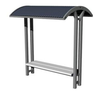
Double Bench Shelter $3,147.00 ex. GST FELDBSH