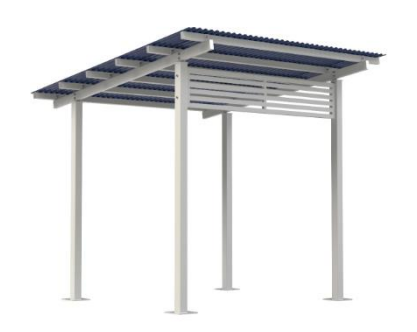
3×3 Aluminium Skillion Shelter $6,380.00 ex. GST FELASS33