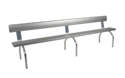
Free Standing Bench Seat With Back Rest $575.00 - $1,031.00 ex. GST PSFSB2 / PSFSB3 / PSFSB4