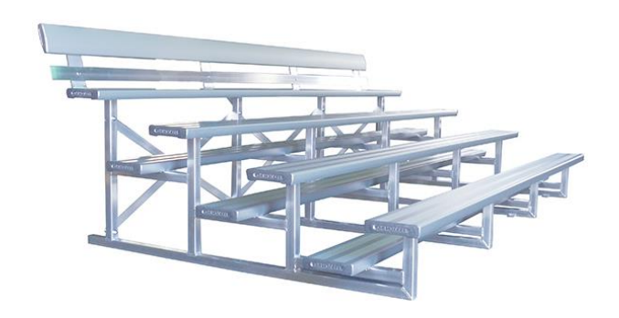
$7,910.00 - $11,848.00 ex. GST Product Code SELG4T4 / SELG4T6