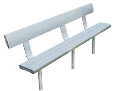
Bench Seat With Backrest In-Ground $575.00 - $998.00 ex. GST FELIGB2 / FELIGB3 / FELIGB4 Above Ground $586.00 - $1,031.00 ex. GST FELAGB2 / FELAGB3 / FELAGB4