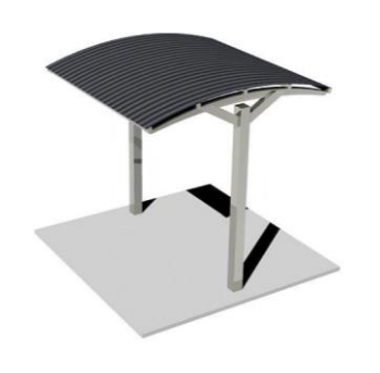
BBQ Shelter $4,340.00 ex. GST FELSPSH