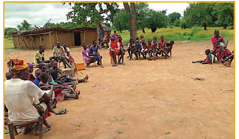
Matuic Church of Christ meeting outside now.