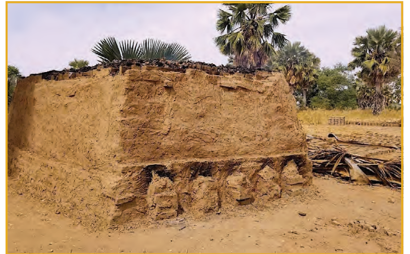
Bricks made by the Matuic Church of Christ for their future building drying.

The roof of the Matuic Church of Christ recently collapsed due to heavy rain. The members of the congregation have been busy making bricks for their new structure and are asking for $10,000 to put a metal roof on their church building.