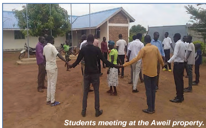
Students meeting at the Aweil property.